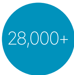
Investors, Consultants, and Managers

It's all about context – the more you have, the smarter your distribution game plan will be. Market Lens is the one-stop shop for institutional investment intelligence that gives managers line of sight into the broader context of the marketplace with insights on: